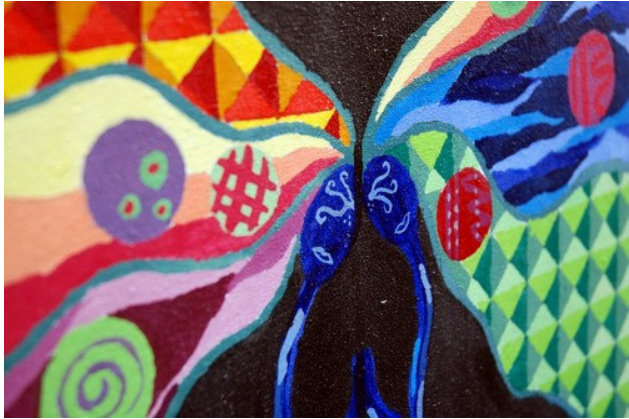
Exhibit lasts until 30 April 2009

40 T. Gener cor. K-1 Streets (near Kamuning Road), Quezon City